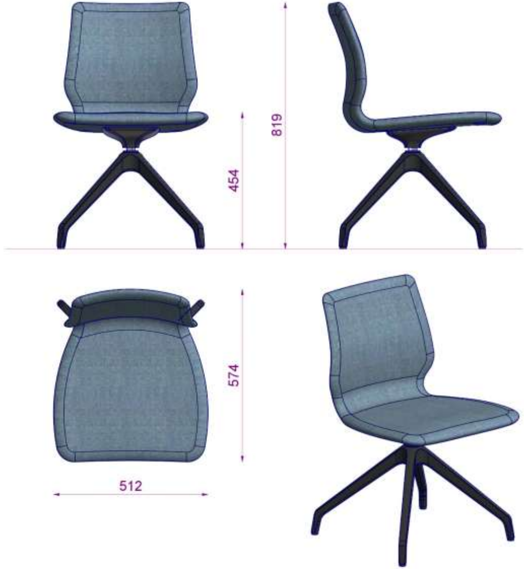
ASANDA S2 MISAFIR S SWISS