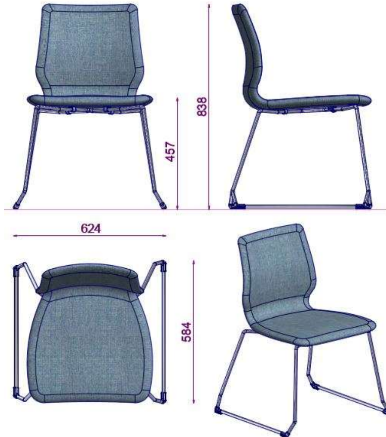
ASANDA S2 SS KA