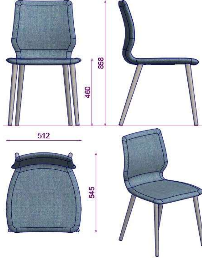
ASANDA S2 MISAFIR S AA