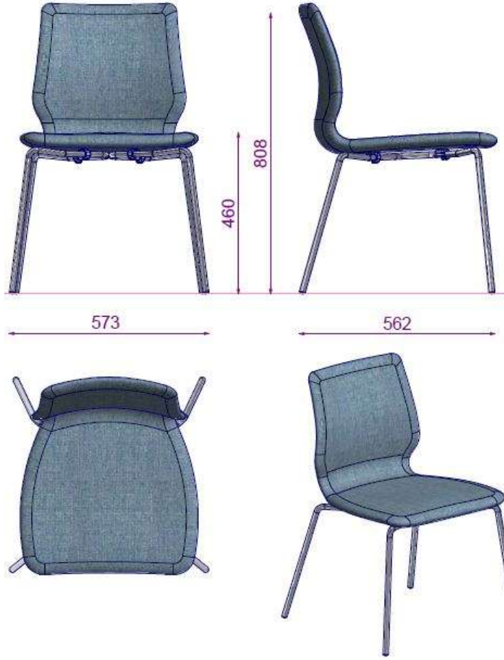
ASANDA S2 SG10 SANDALYE