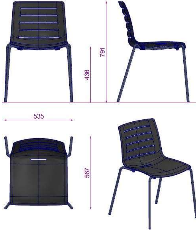
HELEN S1 SG10 SANDALYE PLASTIK FONT