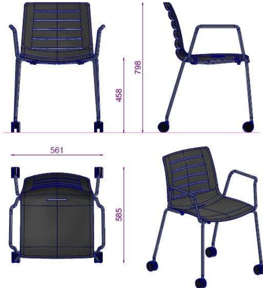
HELEN S1 SG22 SANDALYE PLASTIK FONT