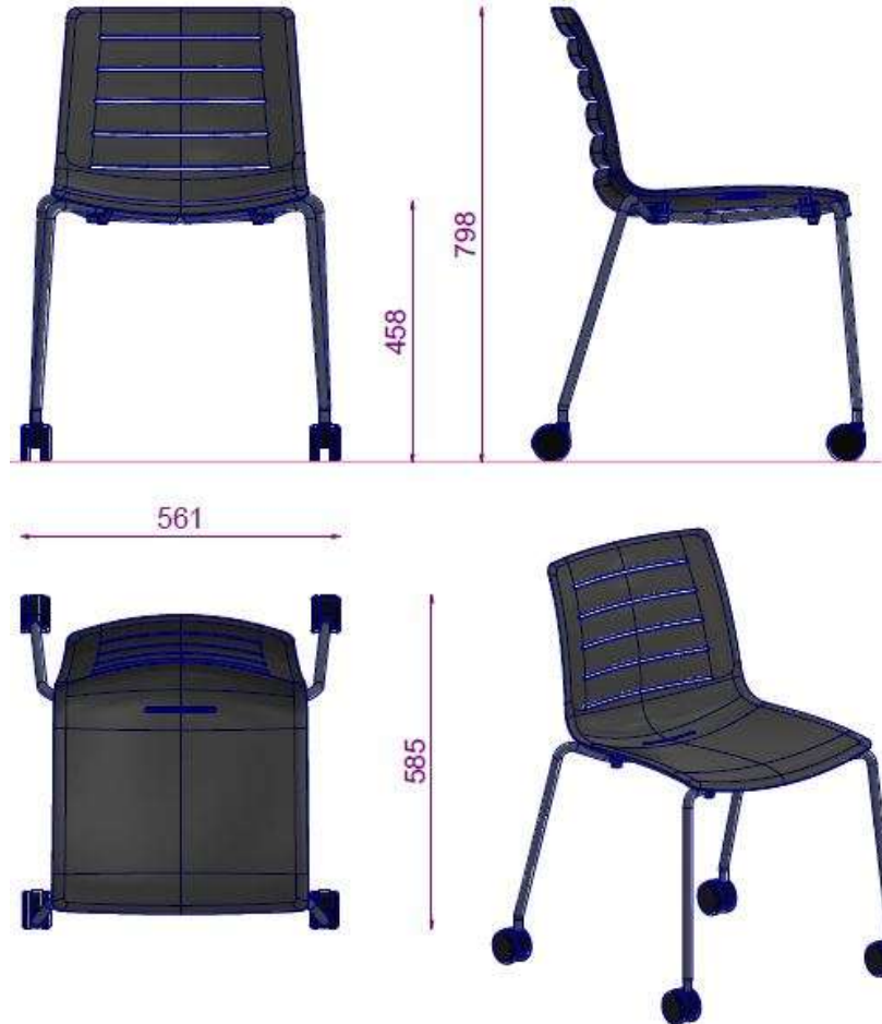
HELEN S1 SG20 SANDALYE PLASTIK FONT