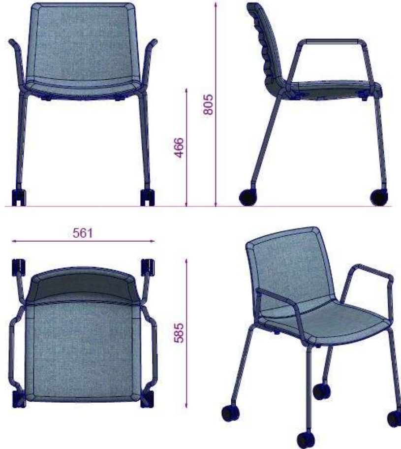
HELEN S1 SG22 SANDALYE DOSEMELI