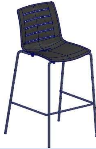
HELEN S1 SB10 BAR SANDALYESI PLASTIK FONT