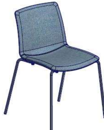
HELEN S1 SG10 SANDALYE DOSEMELI