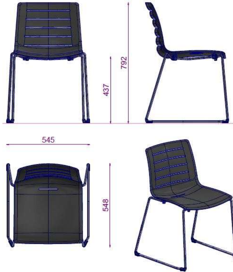
HELEN S1 SG30 SANDALYE PLASTIK FONT