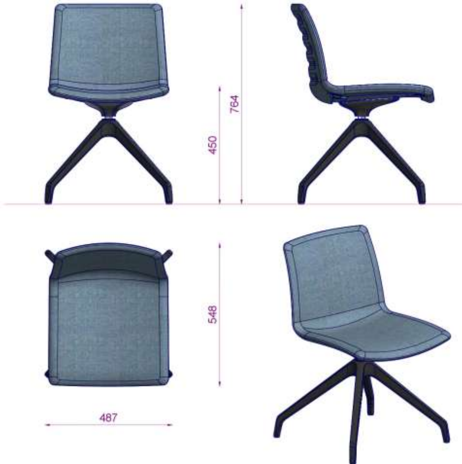
HELEN S0 SANDALYE SWISS