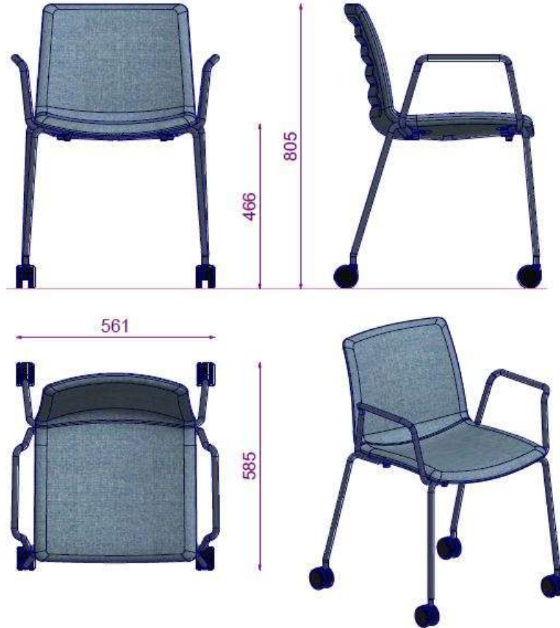
HELEN S1 SG22 SANDALYE DOSEMELI