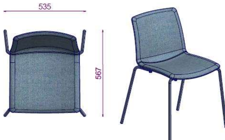
HELEN S1 SG10 SANDALYE DOSEMELI