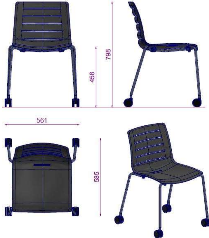
HELEN S1 SG20 SANDALYE PLASTIK FONT