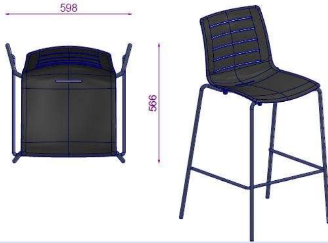
HELEN S1 SB10 BAR SANDALYESI PLASTIK FONT